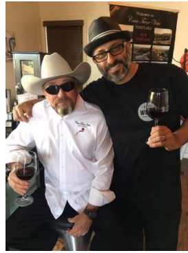
The Winemaker & Chef